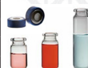
Crimp-top Headspace Vials