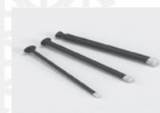
Replacement Plungers for Headspace Syringes