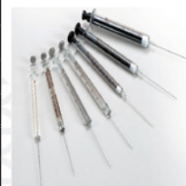
Liquid Syringes (various)