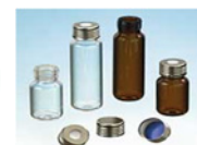
Screw Cap Headspace Vials