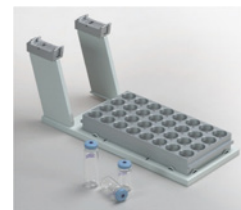
Sample Tray Set 220-94500-39